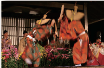
• The oldest folksong in Japan “Kokiriko” Performance at Kaminashi Area

Gokayama is a treasure land of folk songs. Enjoy and experience traditional Japanese dance! Check out the schedule at the website below! https://gokayama-info.jp/en