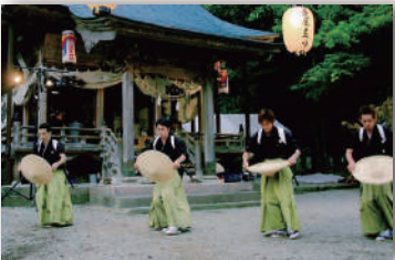
• The nostalgic samurai dance “Mugiyabushi” Performance at Shimonashi Area